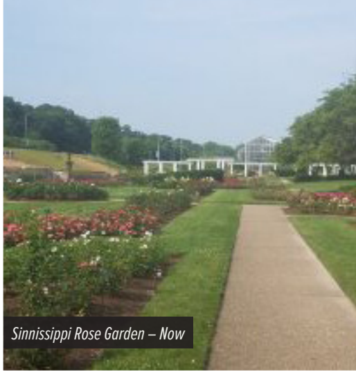
Sinnissippi Rose Garden – Now