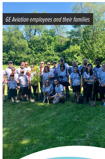
GE Aviation employees and their families