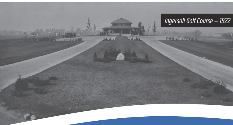
Ingersoll Golf Course – 1922