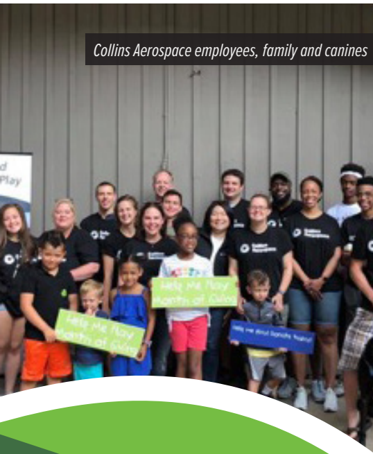
Collins Aerospace employees, family and canines

On July 26, 2018, donors and sponsors of the Rockford Bank & Trust Pavilion went beyond their financial support and "dug in" to get landscaping and flowers planted prior to the grand opening of the Rockford Bank & Trust Pavilion at Aldeen Golf Club. Way to go!