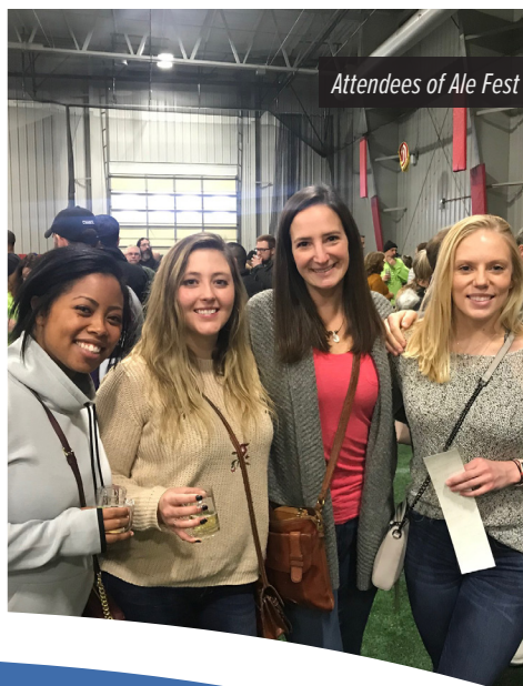
Attendees of Ale Fest