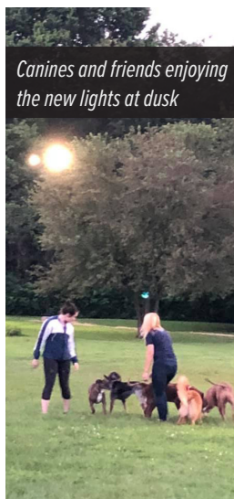
Canines and friends enjoying the new lights at dusk