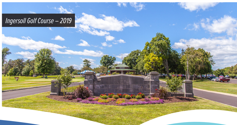
Ingersoll Golf Course – 2019