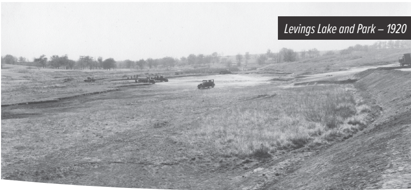
Levings Lake and Park – 1920