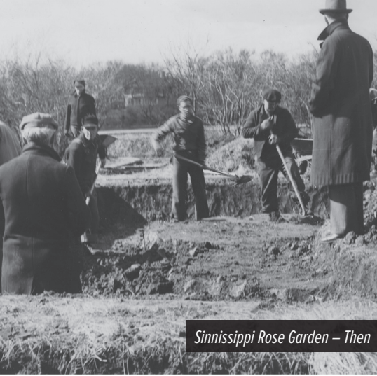
Sinnissippi Rose Garden – Then