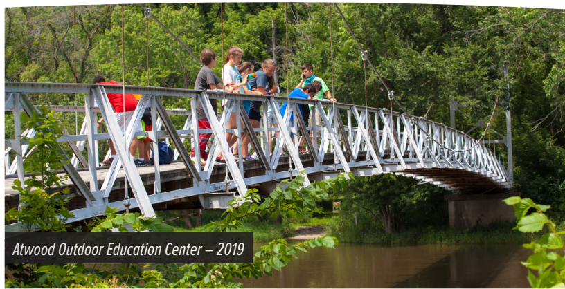
Atwood Outdoor Education Center – 2019